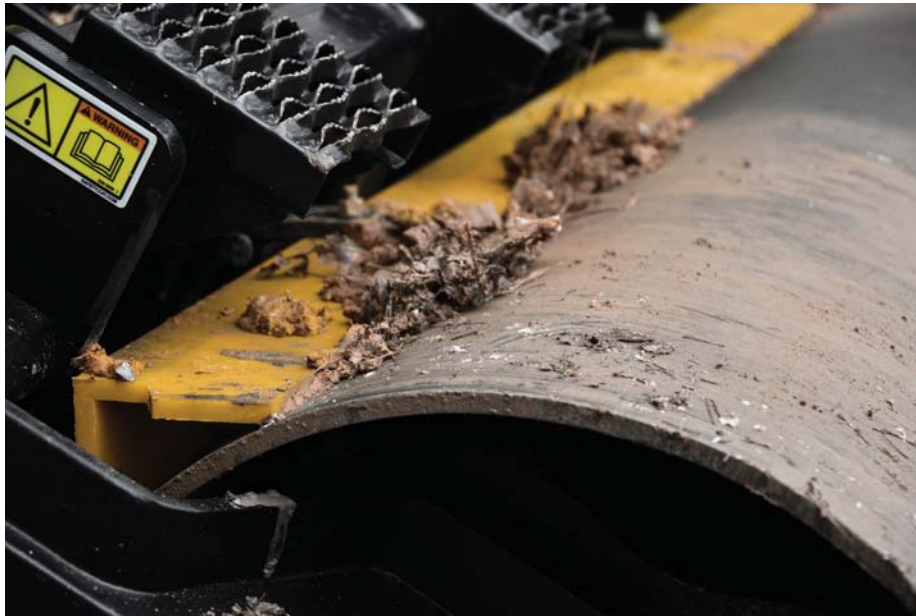
Material Scraper Bar Spring-loaded dual direction scraper bar prevents material build up.