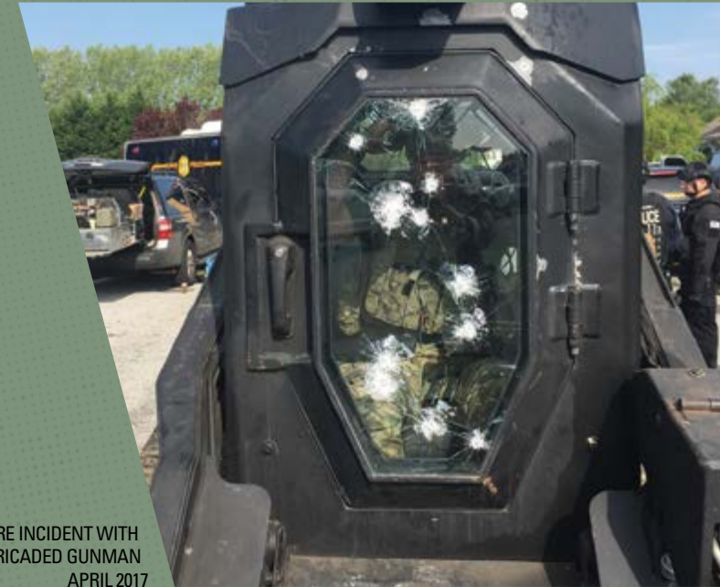
DELAWARE INCIDENT WITH BARRICADED GUNMAN APRIL 2017