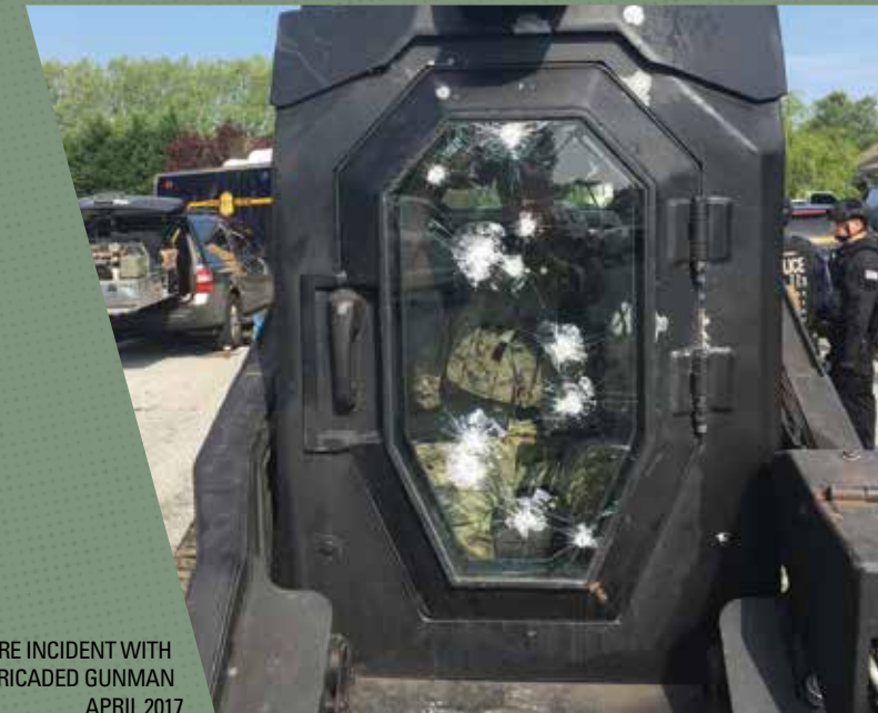
DELAWARE INCIDENT WITH BARRICADED GUNMAN APRIL 2017